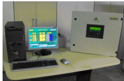
Wastewater Treatment Plant Monitoring and Control